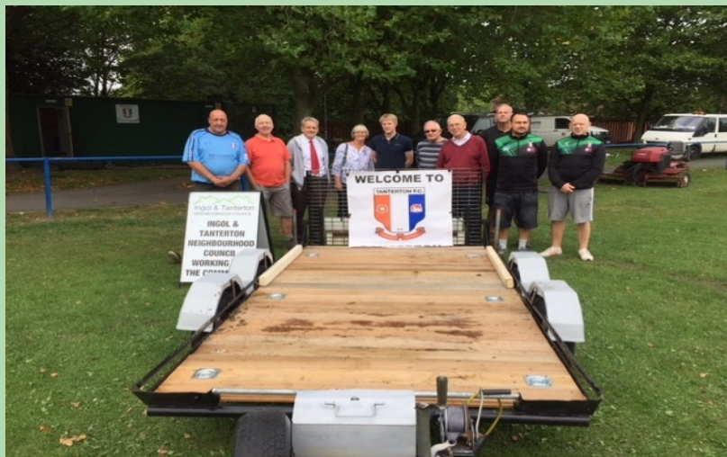
Pictured above is the trailer in front of some members of the NC and Tanterton FC who play in the Lancashire Sunday Football League.

The NC felt that it was important to continue to have the local team play at a local venue, rather than seek alternative facilities, which would have no doubt left the existing ground to become somewhat derelict. The NC agreed to fund the purchase of the trailer which can be seen in the photograph below and hopefully we will see a long and continued use of our local facilities for our local football team.